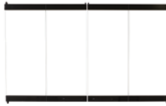
Bi-fold glass doors