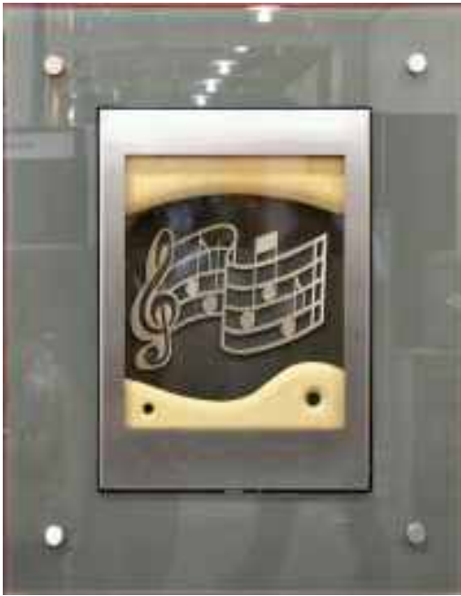
US patent Number 6.910.477