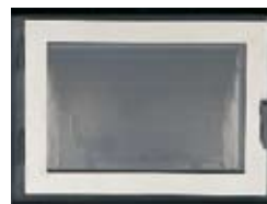
Brushed nickel door