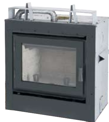
Ladera™ shown with black door

The Dave Lennox Signature™ Collection Ladera™ high-efficiency wood-burning fireplace is a contemporary marvel. Advanced features, like a Double-Air Combustion control, allow you to enjoy a continuous fire without the need for reignites and it helps optimize efficiency. A compact, yet open firebox accepts logs up to 18 inches for large flames, long burn times and additional warmth. And with a clean-face design and expansive viewing area, this EPA-certified fireplace allows you to take pleasure in the modern beauty of an unobstructed fire with a true masonry fireplace feel.