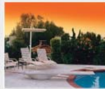
Warmth at poolside