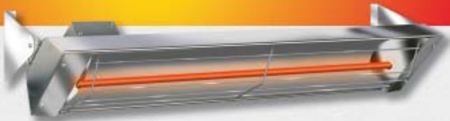
W-SERIES Up to 4000 Watts/13684 BTU's Single Element