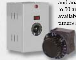
Simple, cost effective Input Regulators

State-of-the-art Digital solid state and analog controls are available up to 50 amps. Many other options are available including multiple zones, timers and non-contact infrared thermocouples.