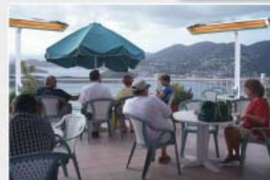
Comfortable heat at your command