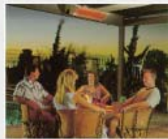
Patios, Sundecks & Balconies