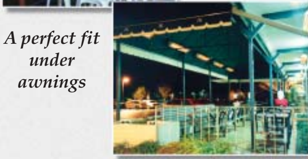
A perfect fit under awnings

A vailable heat outputs range from 1000 watts to over 8000 watts. 120 volts is standard for units under 1500 watts, 240 volts for units over 1500 watts. Standard Fixture size and wattages are 33" 1500 watts, 39" 2000 watts, 61-1/4" 3000 watts plus.