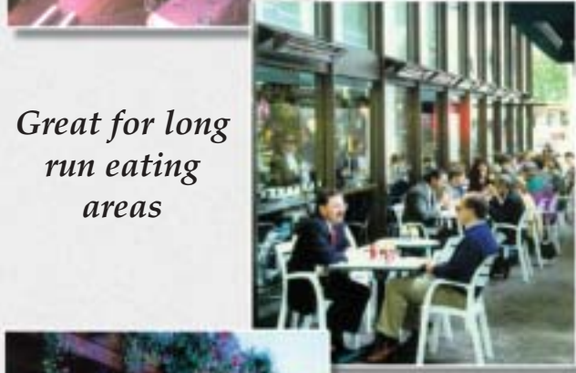
Great for long run eating areas