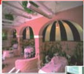
Fits any decor