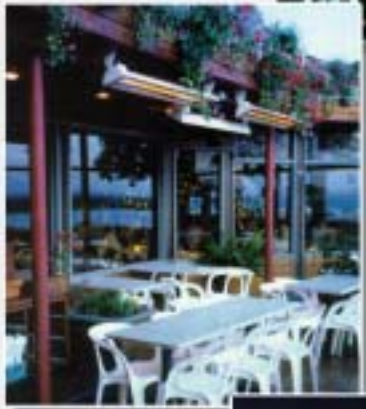
Makes dining more enjoyable

I nfratech Infratube Radiant Heaters have a long service life with no moving parts. Standard heating elements are rated for 5000 hours or up to 5 years. Corrosion resistant stainless steel or powder coated steel units are available in a variety of sizes and voltages for almost any application.