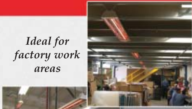
Ideal for factory work areas