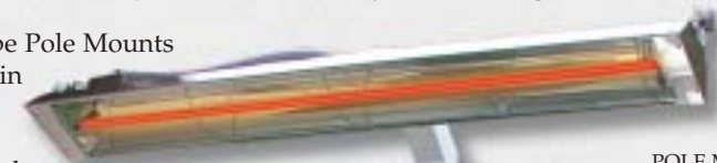
POLE MOUNT HEATER Up to 4000 Watts/13684 BTU's Single Element

Attractive, powder coated Infratube Pole Mounts are 8' high and allow for installation in open areas where heat is required. These are ideal for installation along glass windbreaks, balcony railings and the outer edge of patios. Using Infratube Pole Mounts on the outer edge also eliminates clutter and frees space without wasting heat. Pole Mounts are available with heat output controls and internal wiring.